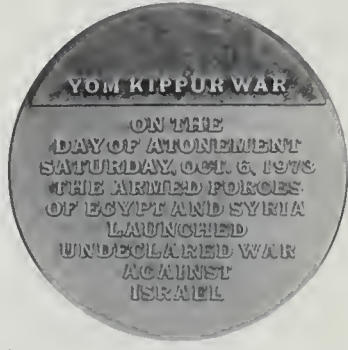
Lot No. 2522